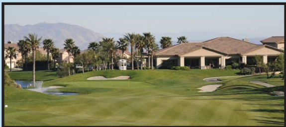
SIERRA LAKES GOLF CLUB

Dear Friends, It's time to golf! We want to thank those of you who have supported the Andre Tate Foundation. You have helped to make a difference in students' lives.